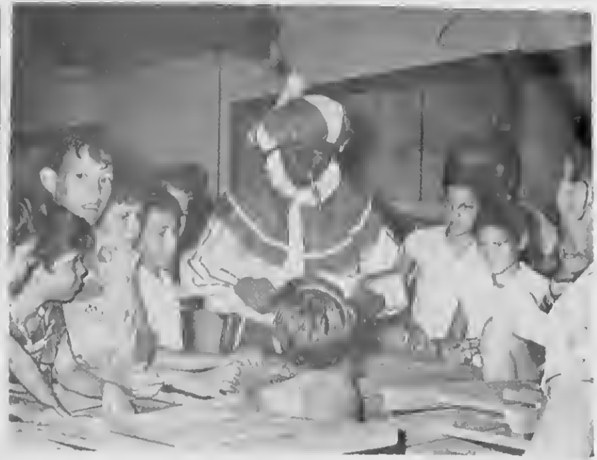
PIERCE THOUGH he appears, Black Peter is the soul of generosity. He corners one boy among some chairs to give him some candy. MASKE CUANTO cruel el ta parce, Zwarte Piet tin un alma generoso. Aki el tin un mucha crá den algun stoel pa dune'le algun cos dushi.